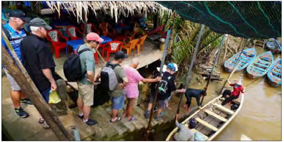
Tour the fascinating and historic Mekong Delta region

Or you may prefer to enjoy a free day in Saigon or Vung Tau to wander the streets, eat some great food and visit some of the top bars for a cold beer or sip of wine. The choice is yours.