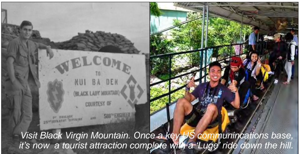
Visit Black Virgin Mountain. Once a key US communications base, it's now a tourist attraction complete with a 'Luge' ride down the hill.