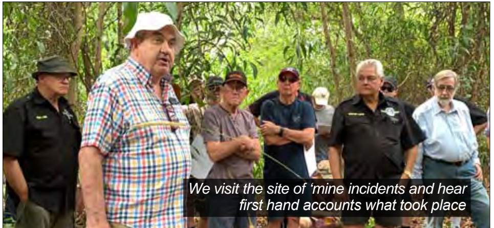
We visit the site of 'mine incidents and hear first hand accounts what took place