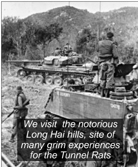
We visit the notorious Long Hai hills, site of many grim experiences for the Tunnel Rats