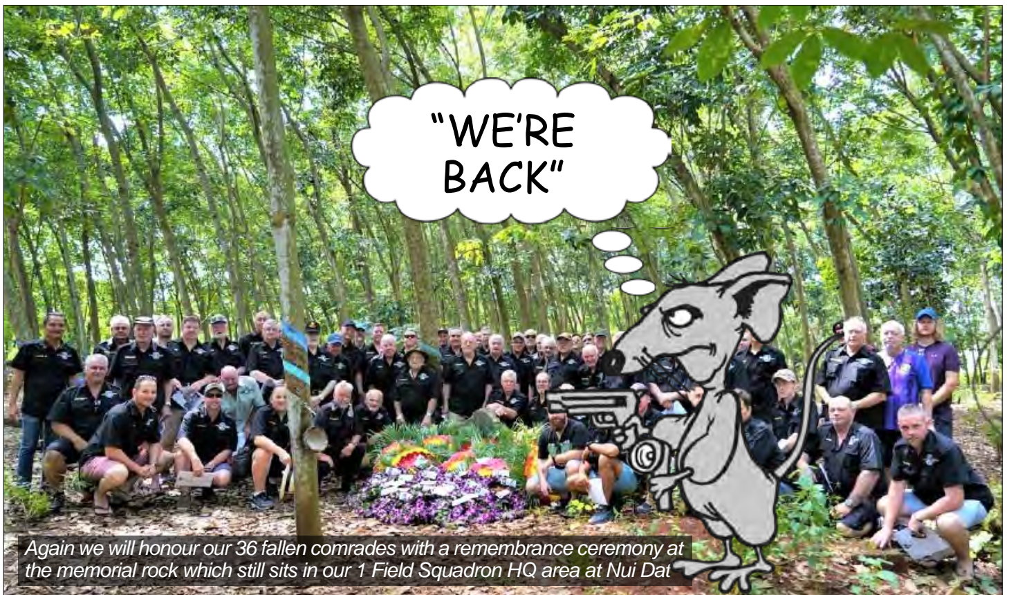
Again we will honour our 36 fallen comrades with a remembrance ceremony at the memorial rock which still sits in our 1 Field Squadron HQ area at Nui Dat