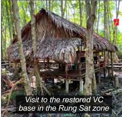
Visit to the restored VC base in the Rung Sat zone

Just a few of the highlights you can expect on the tour