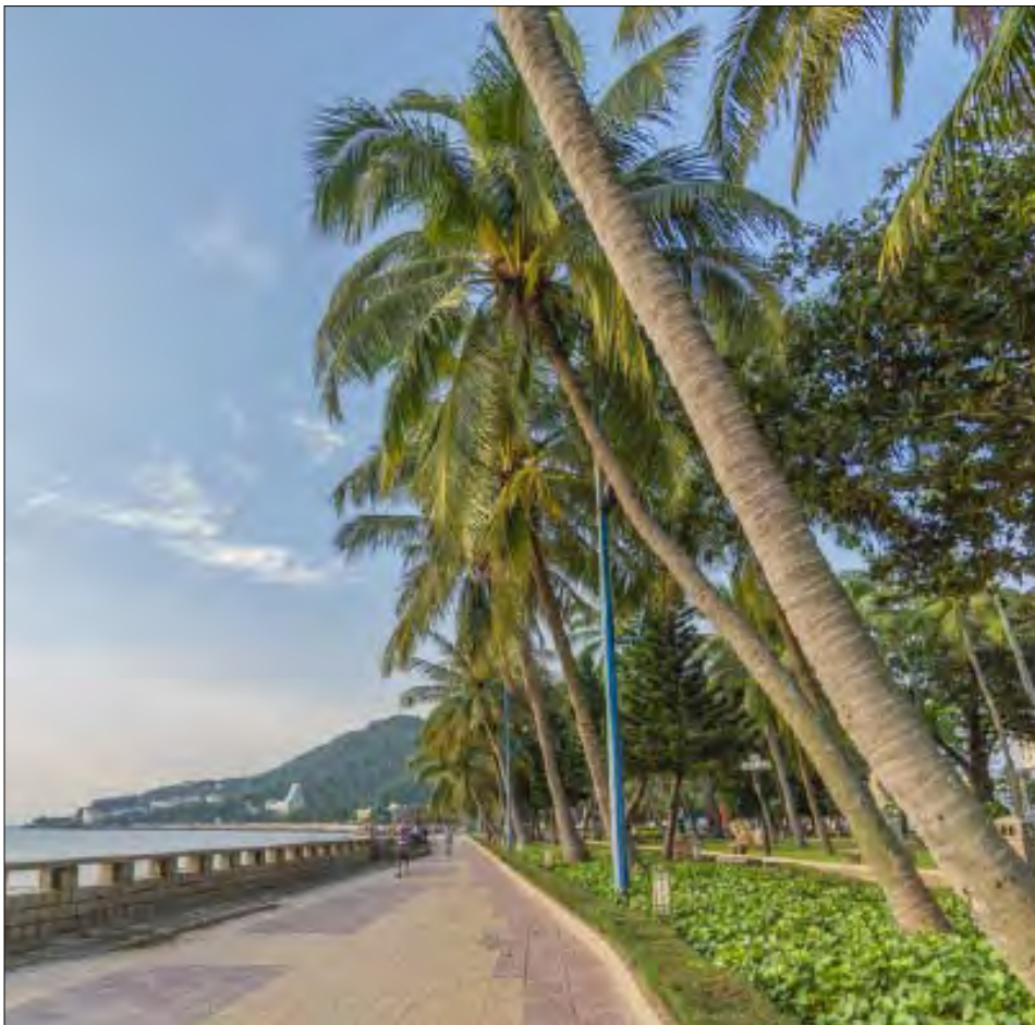
Stroll along Vung Tau's Front Beach to the Grand Hotel and walk through the streets you wandered down all those years ago.

The cost of the tour is detailed in the panel opposite. Despite us now staying in much better hotels in Saigon and Vung Tau, we have been able to keep the cost of the tour remarkably low, and even better value than ever before: $1180 if you are sharing a room, and $370 extra (total $1550) if you want a room on your own.