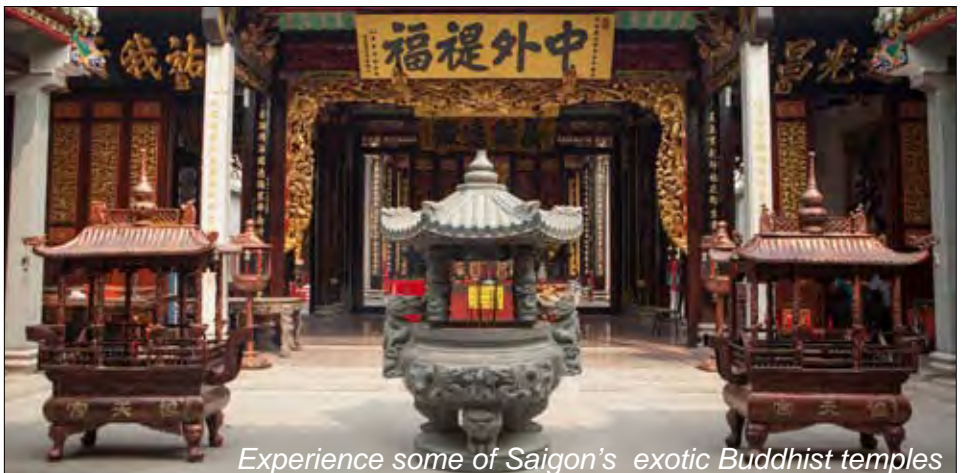
Experience some of Saigon's exotic Buddhist temples