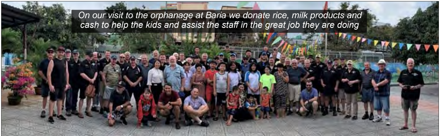
On our visit to the orphanage at Baria we donate rice, milk products and cash to help the kids and assist the staff in the great job they are doing