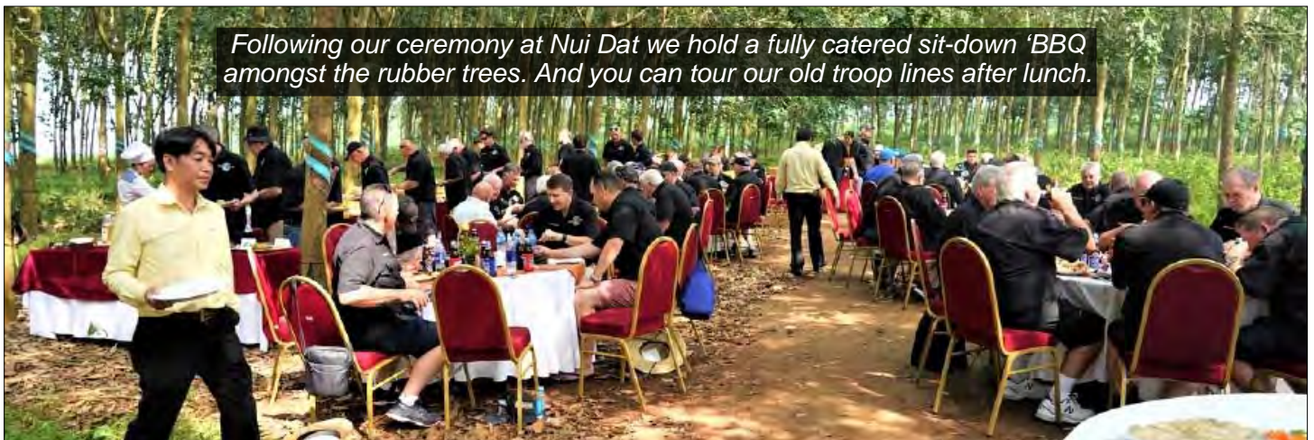
Following our ceremony at Nui Dat we hold a fully catered sit-down 'BBQ amongst the rubber trees. And you can tour our old troop lines after lunch.